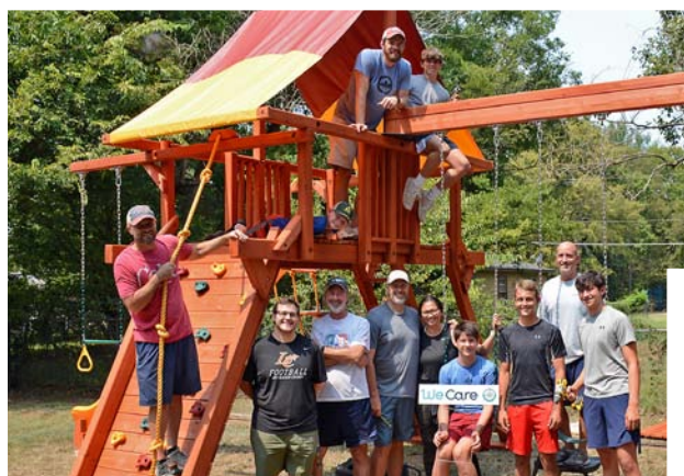
Volunteers from Norris Ferry Community Church build a playground at a Cedar Grove Friendship House.

LOCAL CHURCHES & ORGANIZATIONS DONATE TIME & LOVE