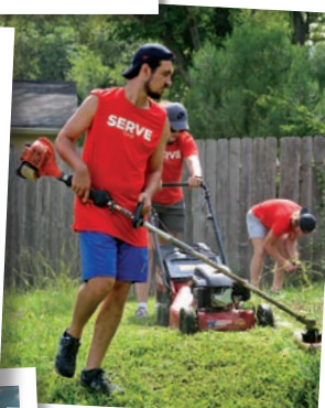
Celebration Church has a long history of service at our Queensborough Friendship Houses.