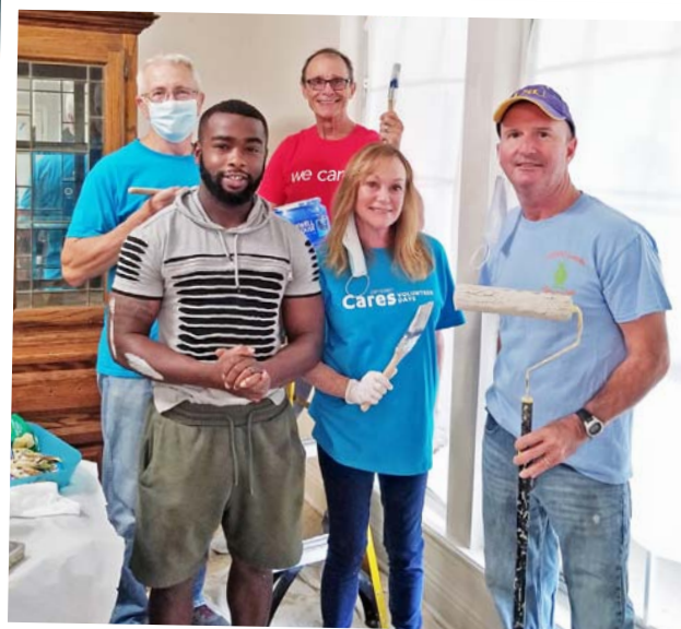
Johnson & Johnson employees participate in Janssen Cares Volunteer Days by painting at a Friendship House.