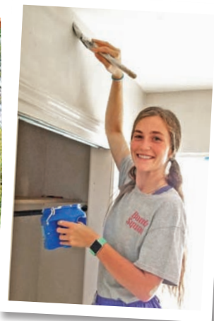
Teens from Broadmoor United Methodist Church paint rooms at a Cedar Grove Friendship House.