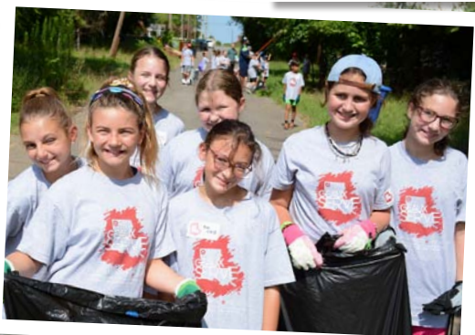
Youth from First United Methodist Church spend a morning cleaning streets in Allendale.